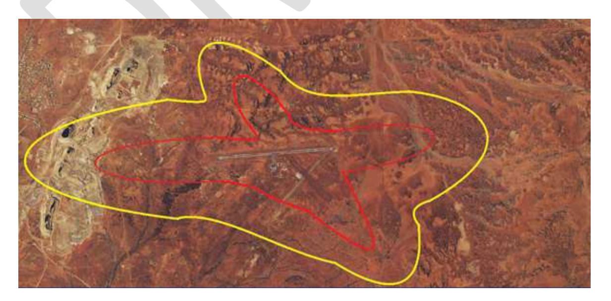
Figure R - Atypical noise footprint

Noise Above Contour (N60/65/70) charts, which calculate the average daily noise events above 60, 65 or 70 decibels (dbA). The Noise Above Contours represent the frequency of the expected aircraft noise impact and provide a more readily understood measure of noise exposure for the general public.