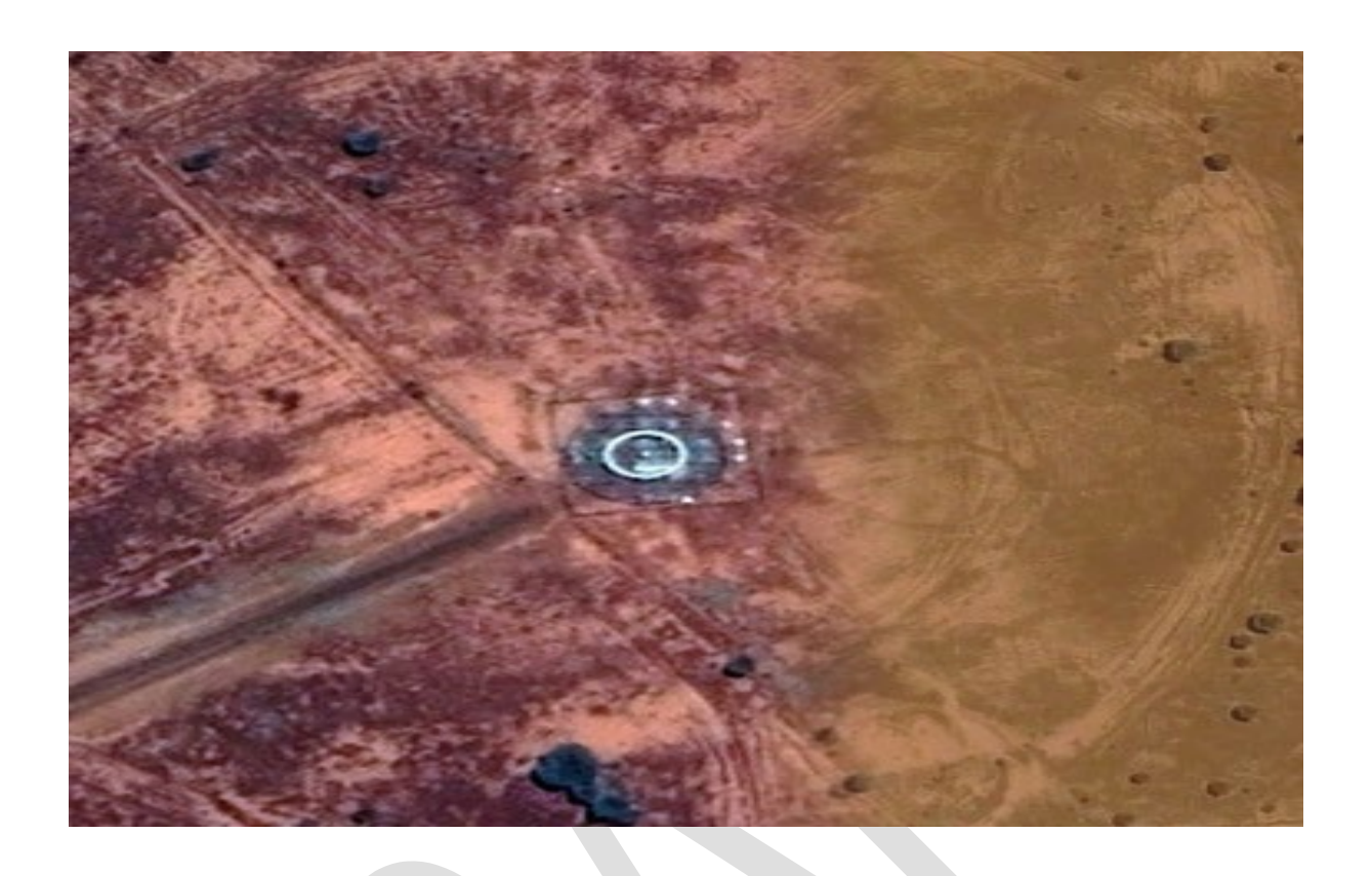
Figure P – Zone 6 - Possible Development Area (Unplanned)