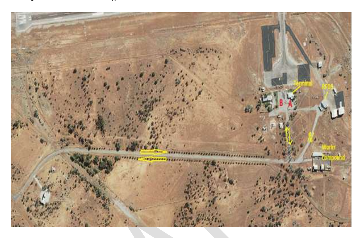
Figure D - Possible Traffic Flow (if required)