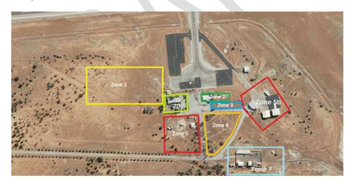
Figure F - General Aviation Overview

These areas haven't been zoned at this stage so each application would be judged on its merits.